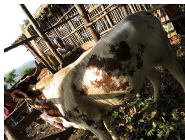
A cow that is being reared by the group