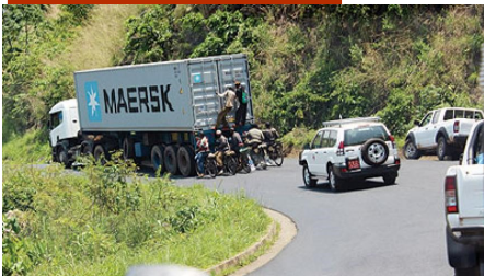
Driving in Bujumbura requires a lot of attention: Some people on bicycles hung on a trailer as others climb so as to get up the hills and home.

With Covid-19, the HOPE program continues except that meeting students in groups is no longer possible. The government has not yet decreed confinement, or has not yet banned gatherings, but as HOPE we have taken steps to protect children and protect ourselves.