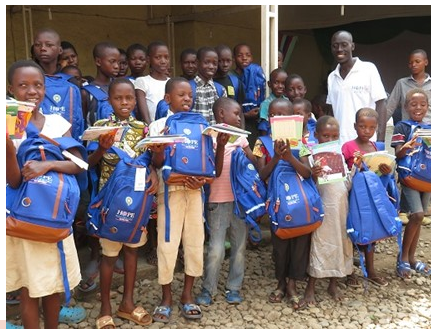
Primary students receiving school materials

The month of September is still a nightmare for majority of Burundian parents and students following the reopening of schools for a new school year. Few of them have sufficient school materials required by the school. When the school opened, the students of BurundiKids program were very happy to be able to go with all the necessary equipment. Despite the socio-economic situation of their families, they go to school with confidence knowing that they will not be expelled from school due to the lack or delay in paying of school fees.