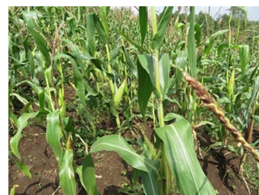
Farming of maize