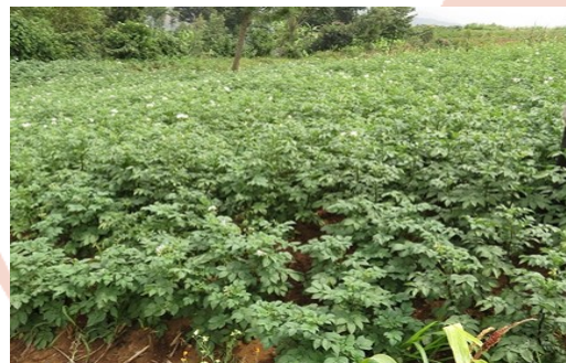
Farming of potatoes

The biggest innovation is that they have acquired a cow to reduce the blow of the manure they use. They have hope for the future.