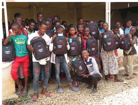
Secondary students receiving school materials